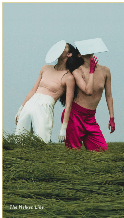
The Nelken Line

A unique fusion of robotics and choreography resulting in surprising grace.